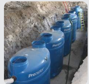
Buried and other flexible options